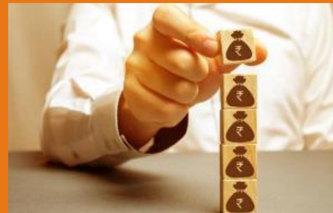
Faster EBITDA Growth