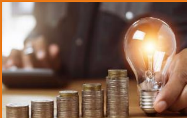
Strong Revenue Growth